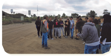
Amelia Earhart High School Students

SunshineCanyonLandfill.com or call 800.926-0607