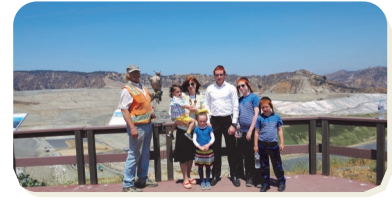
Homeschool Group from Hollywood