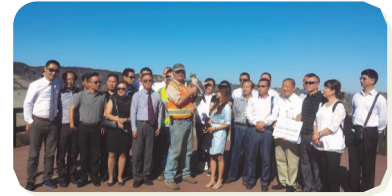
November 14 Delegation from China