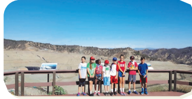
November 11 Students from St. Mel Catholic School

SunshineCanyonLandfill.com or call 800.926-0607